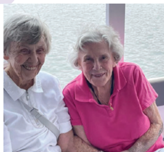
Residents enjoy time with friends and the scenic views of Portage Lakes from the Portage Princess pontoon boat.