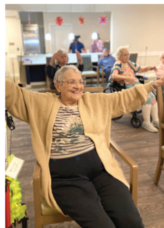
Residents loved learning how to tap dance—seated!