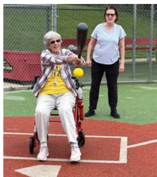
The love of playing ball knows no age limit!