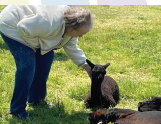
Residents enjoy the gentle alpacas at Majestic Meadows Alpaca & Boutique.

The Village is committed to providing an exceptional living experience for the ones you love. With your support, VillageLIFE will continue to deliver activities and experiences that build cherished memories, lasting friendships, and deepened faith.