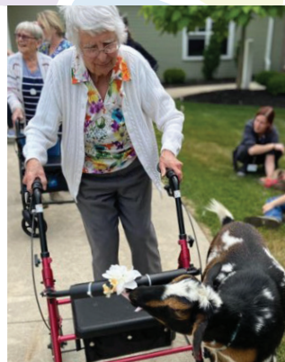
Residents interacted with animal friends from Uncle Dave's Traveling Farm.